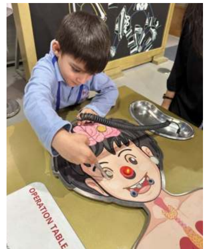
TDF Magnifi Science Museum