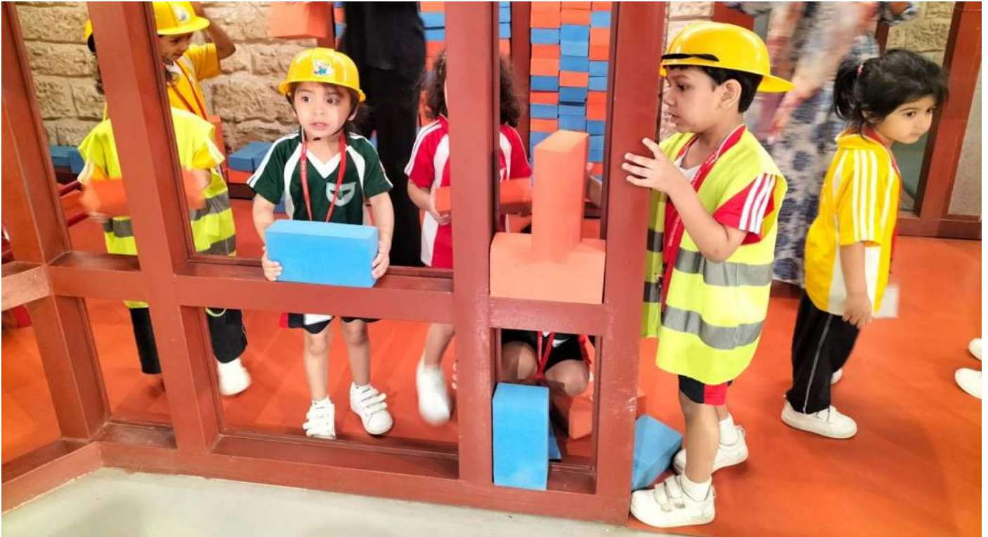
TDF Magnifi Science Museum